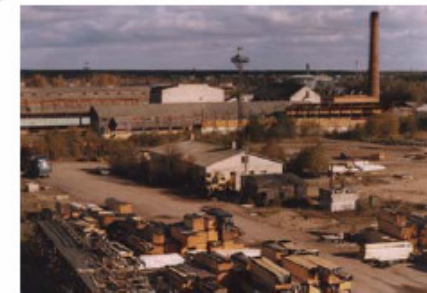
The industrial area (backyard)