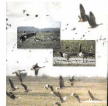
The majesties of the geese capital