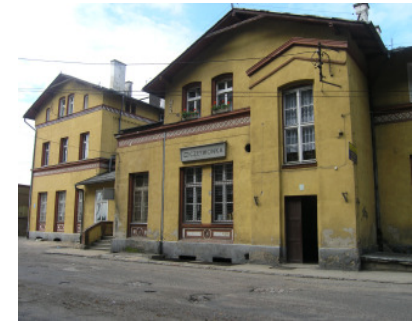
Old train station from 1900