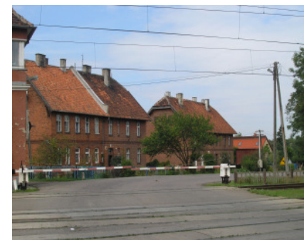
Houses of last workers of rail