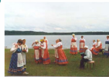
Folk event in the village to entertain them