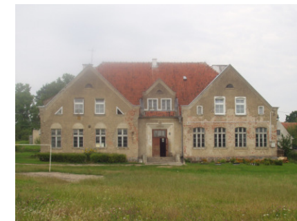
The old palac, now privat flats