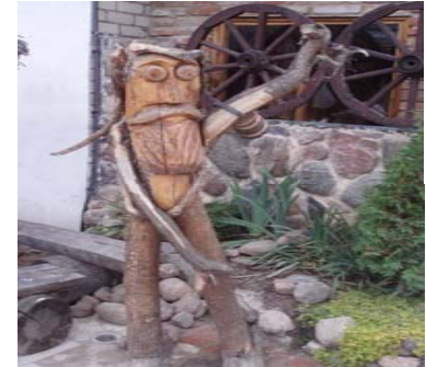
Nicely decorated coffee-house of the town