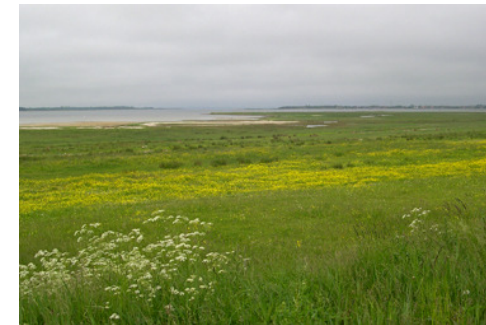
Coast line meadow near Selde