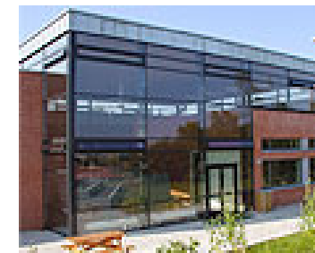
Newly renovated school