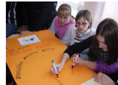
Republican project “Friendly Lithuania”