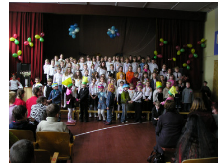
Show “Lithuania – singing bird”