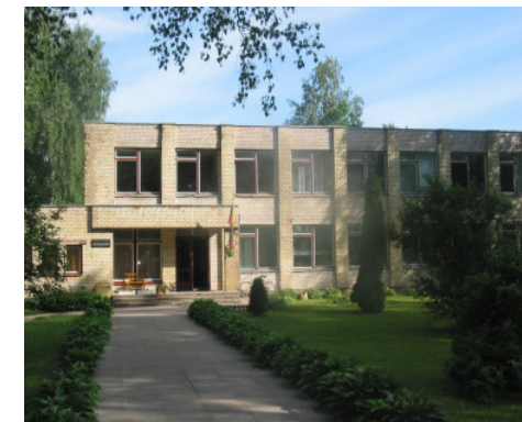
Juodaičiai basic school