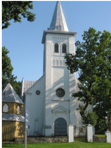
Juodaičiai church in 2007

Examples from typology : type Nr. 8 Juodaičiai locality