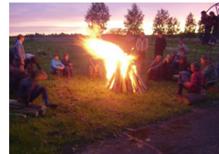
Mini camp: waiting for sunrise