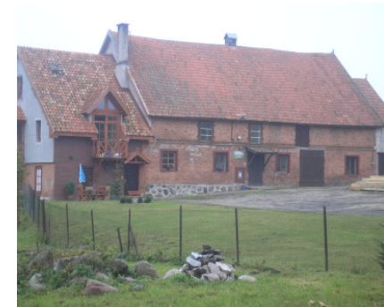
New enterprise in the village