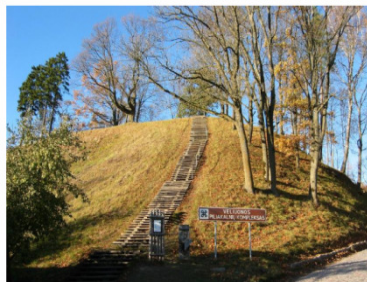
Gediminas grave mound