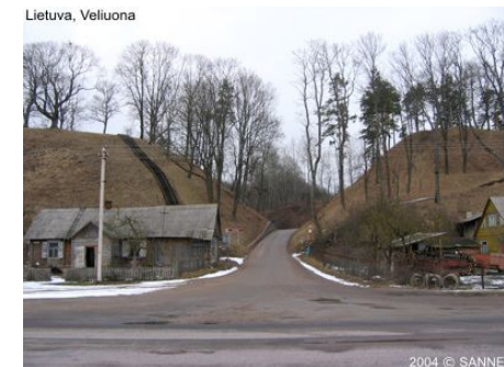
Lietuva, Veliuona Main entrance to Veliuona