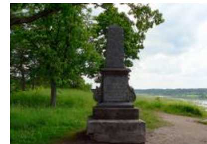
Memorial for Gediminas