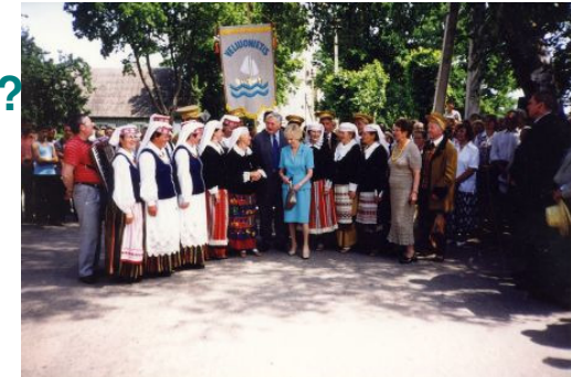
Stay oh His Excellency V. Adamkus