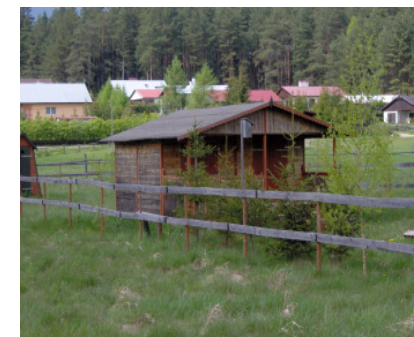
Recreational areas near Dadaj Lake