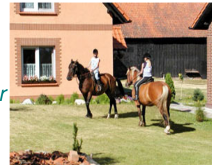
Agritourism farm in Wilimy II